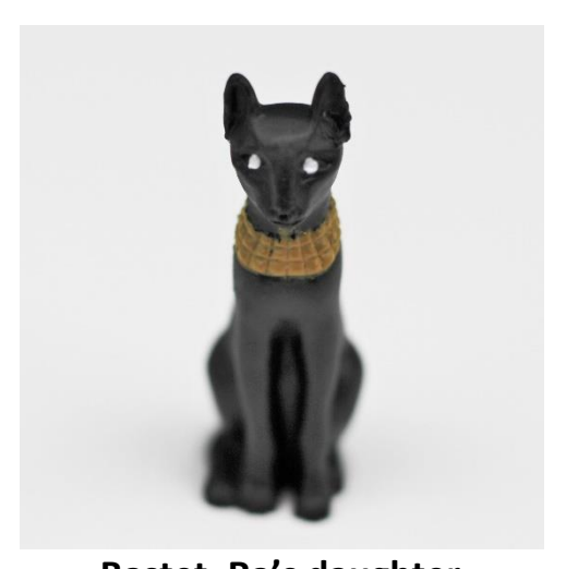
Bastet, Ra's daughter

The cat goddess was believed to have the sun's power to make crops grow.