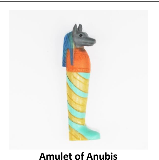
Amulets were magic charms wrapped in the linen strips of mummies.