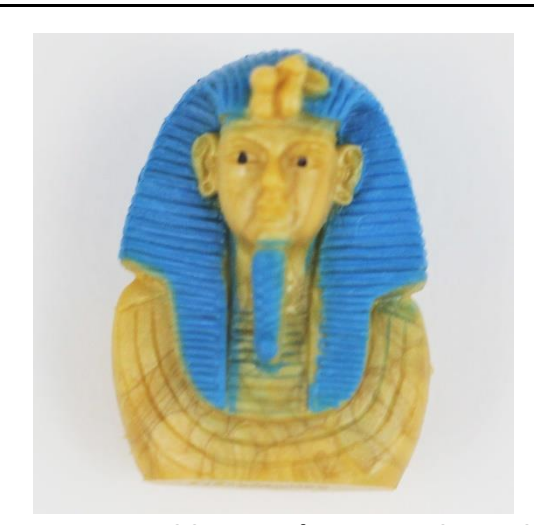
King Tutankhamen's Funeral Mask Mummies often had masks that looked like the person wrapped inside. King Tut's mask was made of solid gold.

A type of beetle. Scarab amulets symbolize rebirth in the Next Life.