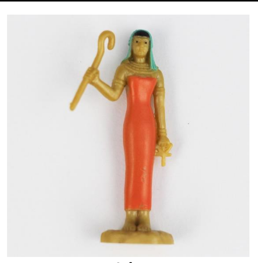
Isis Thought to be the 1st queen of Egypt who became the goddess of healing, marriage, & motherhood.

A mummy is a dead body protected from decay. The body is covered with oil, spices, & salt, wrapped with linen, and placed in a case.