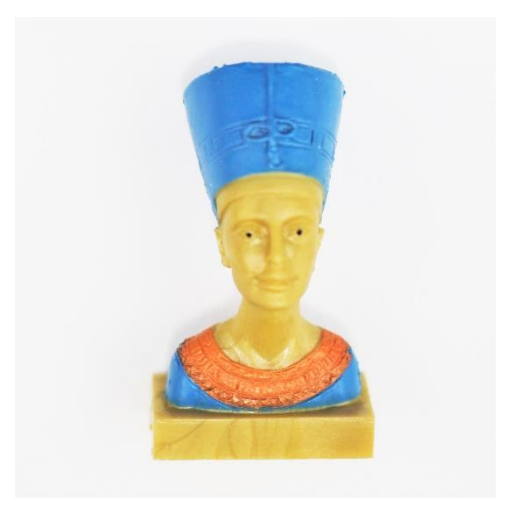
Queen Nefertiti A famous Egyptian queen thought to be more powerful than most. She may have even ruled over Egypt as pharaoh for a time.