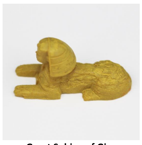
Great Sphinx of Giza

The most famous Egyptian pyramids. The largest, called the Great Pyramid, is almost 500 feet tall.