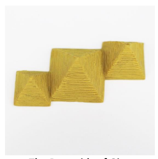
The Pyramids of Giza

The most famous Egyptian pyramids. The largest, called the Great Pyramid, is almost 500 feet tall.